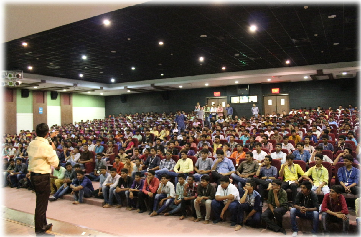
Students asking for their doubts after the session

The session was arranged for third semester diploma engineering students for following departments: