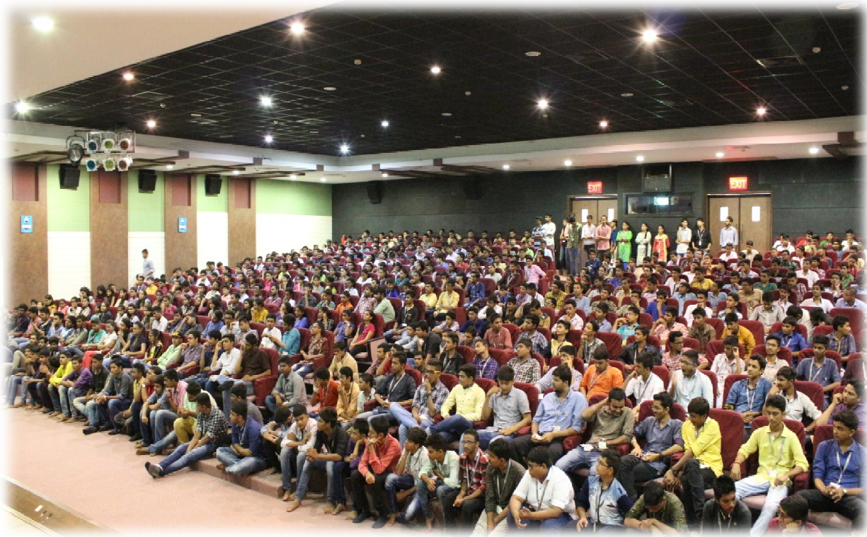
Students of Diploma engineering attending session