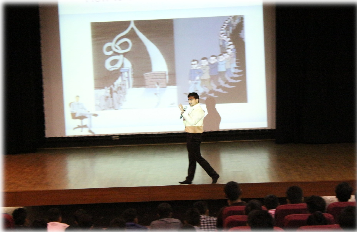
Session on Career Path, Parul Polytechnic Institute